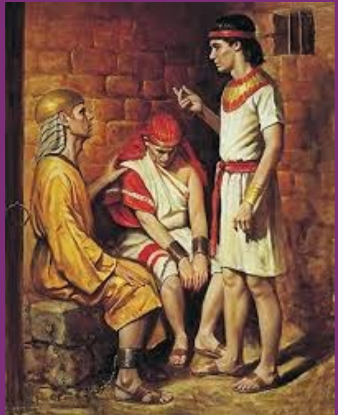
Joseph in prison with Pharaoh's butler and baker

May 2021 be a trusting year with all the problems that we may be called upon to face. Relating to God and others with love, showing kindness, being forgiving, and sharing the Good News, "Jesus saves."